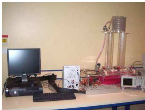
Figure 1. The system.

The process control chosen is the classical physical system used in many control laboratories [5], [6] that is to say the double-tank process shown in Fig. 1 whose features are given in table 2.