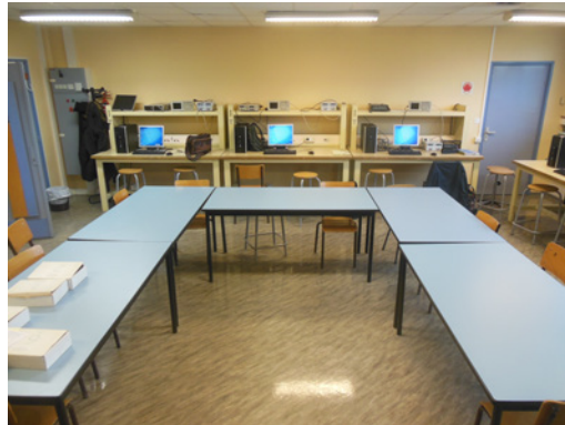
Figure 2. The classroom and the labroom.

The second part of the classroom is devoted to the practical work. A set of six platforms is installed in front of wall or windows such that the students can easily move from their platform to another and discuss with others. The technical equipment is composed of the microprocessor mounted on a board, an oscilloscope, wired connectors and a computer and its software development tool. An oscilloscope, a power supply, a voltmeter end the equipment.