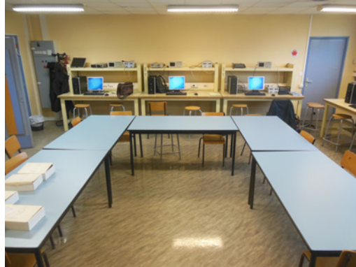
Figure 2. The classroom and the labroom.

The second part of the classroom is devoted to the practical work. A set a six platforms is installed in front of wall or windows such that the students can easily move from their platform to another and discuss with others. The technical equipment is composed of the microprocessor mounted on a board, an oscilloscope, wired connectors and a computer and its software development tool. An oscilloscope, a power supply, a voltmeter end the equipment.