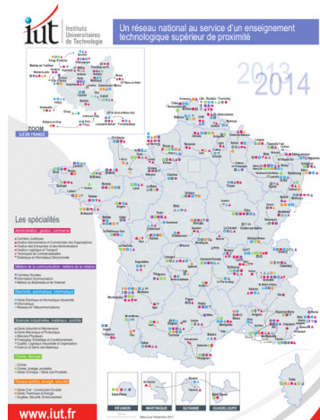
Figure 1 : The Institutes of Technology in France

opportunity to do something equivalent. The creation of Institutes of Technology was also part of territorial management. As Universities are only located in bigger towns, the creation of Institute of Technology in medium-sized cities is an opportunity to bring new technologies everywhere in the country to help local companies. It is also an opportunity to bring more young people to new jobs, in particular people from families with low income, who could not afford studies in bigger and more expansive towns. The map on Fig.1 shows the geographical breakdown of IUT.