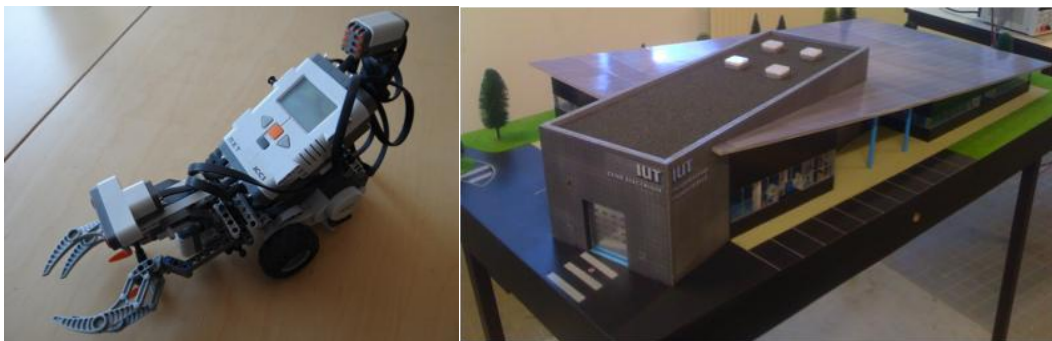
Figure 3: Left, a rover in Lego bricks moving in a maze ; Right, a building mock up equipped of sensors to be programmed

Now, all further activities have been planned months before. The teachings success is mainly due to the reverse teaching in an international challenge. The main documentations, reports, presentation and programs are given to the student through a data base as Moodle for example. Such a success has been possible thanks to administration, colleagues, academic staff and students.