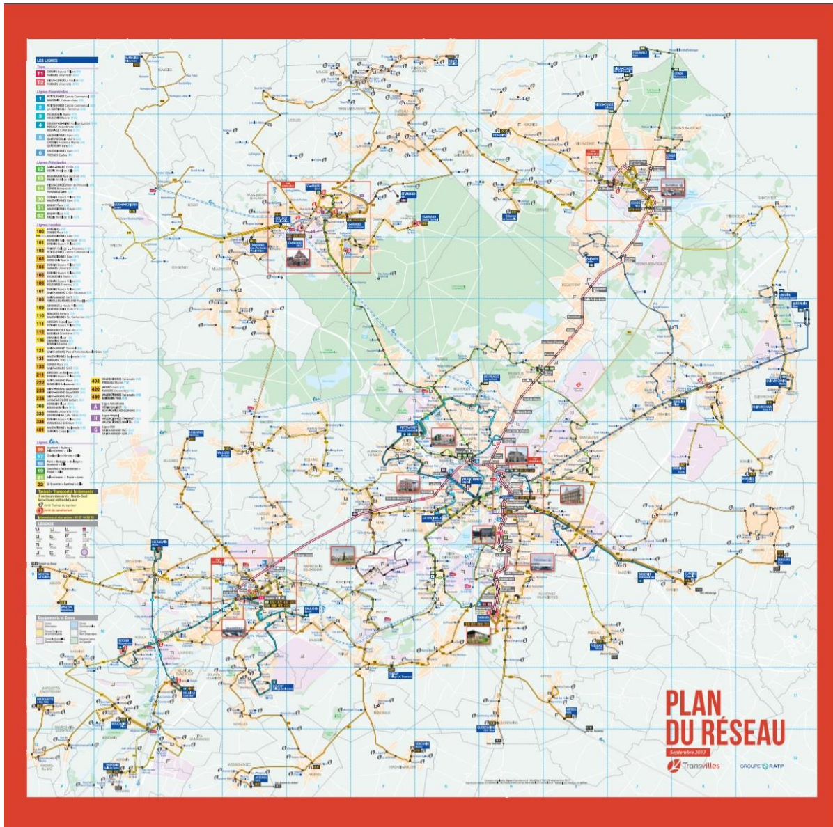
Figure 3. Public transport network, Valenciennes, France