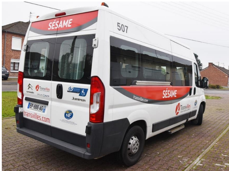
Figure 2. Type of vehicle using for transport on demand