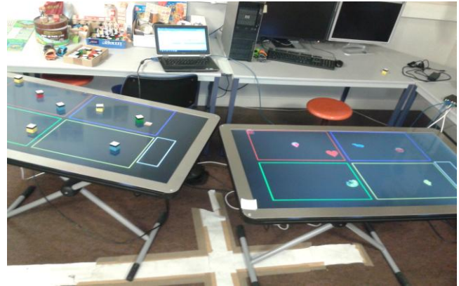
Figure 2. Picture of the distributed application showing the child's view on the left side (with tangible objects) and the parents' view on the right side (with virtual objects as feedback).

In Figure 3, we present the object diagram of the Request for assistance collaborative use case. We see in the figure the Tangigets use for the realization of a distributed task between a child and his father.