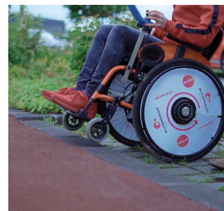
Figure 1: Self-balancing wheelchair