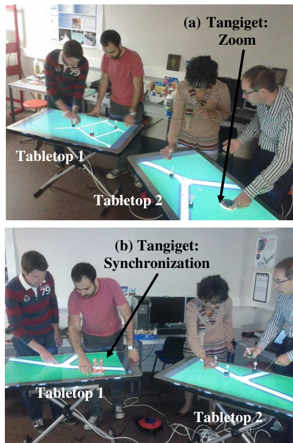
Figure 2. Road traffic management on two TangiSense with Tangigets (a) without effect on the other tabletop, (b) with effect on it

Figure 2(b) shows another example: a Tangiget with distributed properties is used on the tabletop 1. These properties allow it to be cloned using agent located in another interactive surface. The advantage of this Tangiget is to coordinate display tabletops to work together on the same area. When this object is put down on the tabletop 1, the tabletop 2 will generate a clone agent (these two agents exchange messages in order to keep the data coherence). Messages contain the position and the scale of the map. This message is used by the tabletop 2 to obtain the same vision as the tabletop 1.