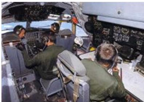
Figure 3: The military air transport system cockpit.

take a large number of decisions in uncertain situations. Their activities were reproducible using a flight simulator of a BC-135 Boeing during in-flight refuelling.