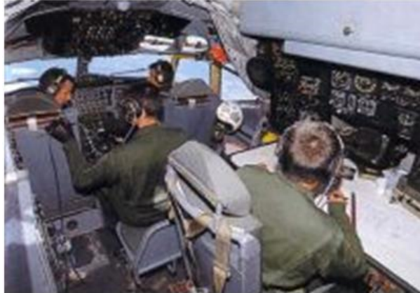
Figure 3: The military air transport system cockpit.

take a large number of decisions in uncertain situations. Their activities were reproducible using a flight simulator of a BC-135 Boeing during in-flight refuelling.