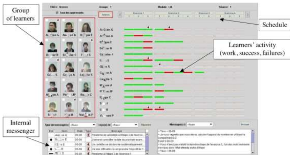
Figure 2. Project FORMID: view on the learners' progress in the learning scenario (anonymized screenshot, Gueraud et al. 2004)

We can include the project FORMID (Gueraud et al. 2004) that allows to monitor and to compare the progress of a group of learners (Figure 2). The system is based on a scenario and tracks both finely modeled.