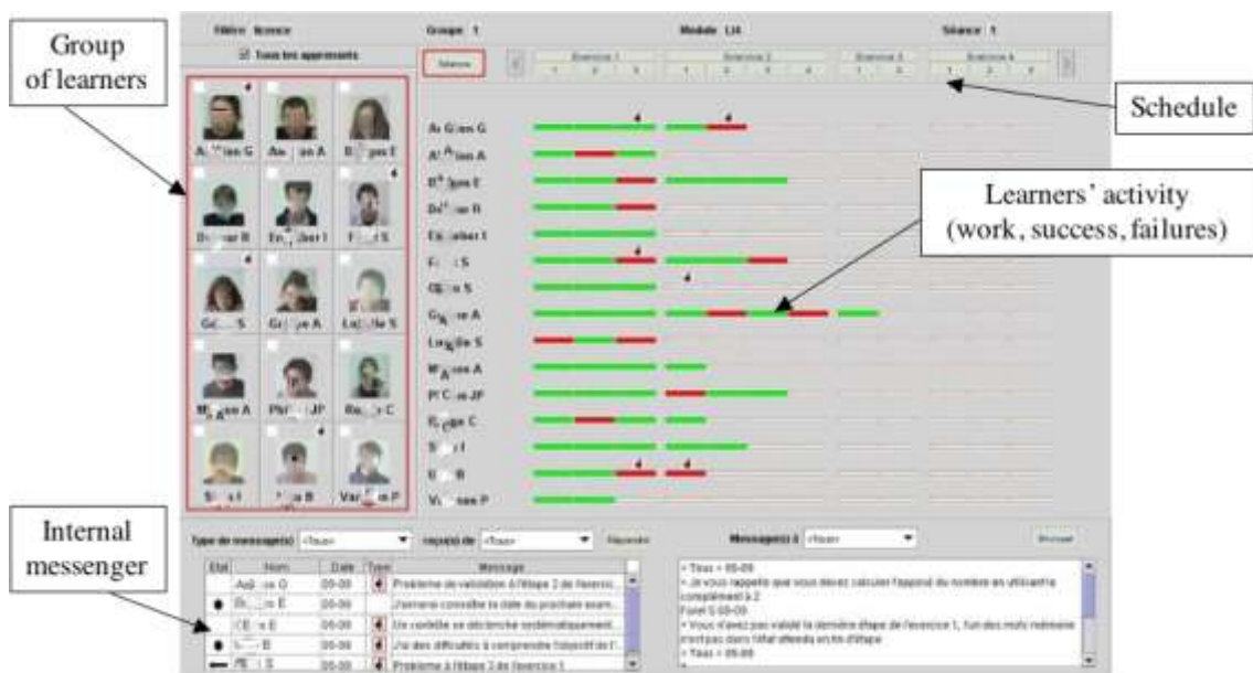
Figure 2. Project FORMID: view on the learners' progress in the learning scenario (anonymized screenshot, Gueraud et al. 2004)

We can include the project FORMID (Gueraud et al. 2004) that allows to monitor and to compare the progress of a group of learners (Figure 2). The system is based on a scenario and tracks both finely modeled.