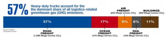
Fig2: Road fright emissions [10]

The largest source of air pollution in this world is Transportation. Pollution caused by trucks and car are responsible for immediate and long-term effects on the environment, Exhausts from car emit a large percentage of gases and solid matter which are responsible for acid rain, global warming and environmental / human health hazards. Also, Fuel spills and noise generated by Engine causes pollution. Cars, trucks and other forms of transportation are the largest contributor to air pollution in the United States, but car owners can reduce their vehicle's effects on the environment [9]