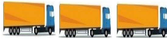
Fig1: trucks platooning

trucks [8]. Recently, the Green transportation and sustainable freight transportation are increasingly important issues in view of rising fuel costs and environmental concerns. Although all forms of transportation contribute to greenhouse gases and congestion, trucking has the largest impact. Truck platoon technologies can be optimized for green road freight transportation to reduce environmental hazard without affecting the maximum output of the trucks.