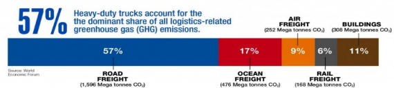
Fig2: Road fright emissions [10]

The largest source of air pollution in this world is Transportation. Pollution caused by trucks and car are responsible for immediate and long-term effects on the environment, Exhausts from car emit a large percentage of gases and solid matter which are responsible for acid rain, global warming and environmental / human health hazards. Also, Fuel spills and noise generated by Engine causes pollution. Cars, trucks and other forms of transportation are the largest contributor to air pollution in the United States, but car owners can reduce their vehicle's effects on the environment [9]