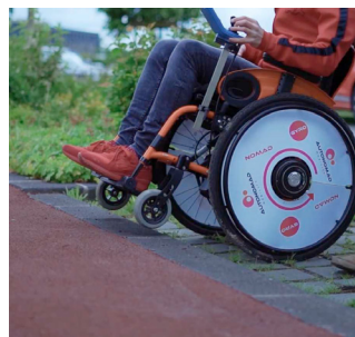
Figure 1: Self-balancing wheelchair