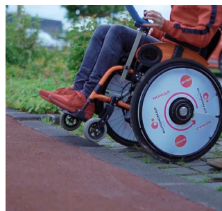
Figure 1: Self-balancing wheelchair