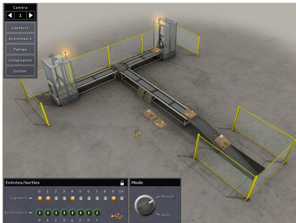
Figure 1-1: Sorting process of cases simulated with ITS-PLC

In our study, the filter stops the operating part as soon as a dangerous forbidden state is detected. The maintenance agent has no clues to direct her/his search in order to detect the error in the command. Figure 2.1 represents such a situation, simulated with ITS-PLC software. The KHC of the assistance system provides information to help the maintenance agent to build clues through the use of the common work space.