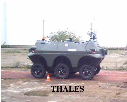
Fig. 2. The R-Trooper of Thales Optronics SA

Know-how of each agent must be identified. It is realized according to a table describing, for each level of activity, the agent’s needs in terms of information acquisition, information analysis, decision and action selection, and action implementation (for example, cf. table 2). This information is usually mainly identified concerning robot. Engineers know the abilities of the robot they build but they are not used to split functionalities as proposed here. This translation is a necessary work to make robot abilities understandable by future users. Technical features are translated in order to be adapted to human operator vocabulary and activity.