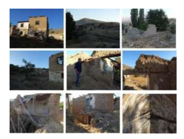
Figure 5. Houses and constructive details of Eski Porsuk village

Kerpic '22 – Re-Thinking Earthen Architecture for Sustainable Development 9<sup>th</sup> International Conference, Istanbul Turkey, 30 June –03 July / 2022