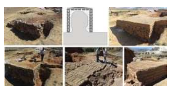
Figure 7: Conservation action of tower North-West, chantier 2, Porsuk – Zeyve Höyük (© Porsuk – Zeyve Höyük archaeological mission & © CRAterre_C. Sadozaï)

Kerpic '22 – Re-Thinking Earthen Architecture for Sustainable Development 9<sup>th</sup> International Conference, Istanbul Turkey, 30 June –03 July / 2022