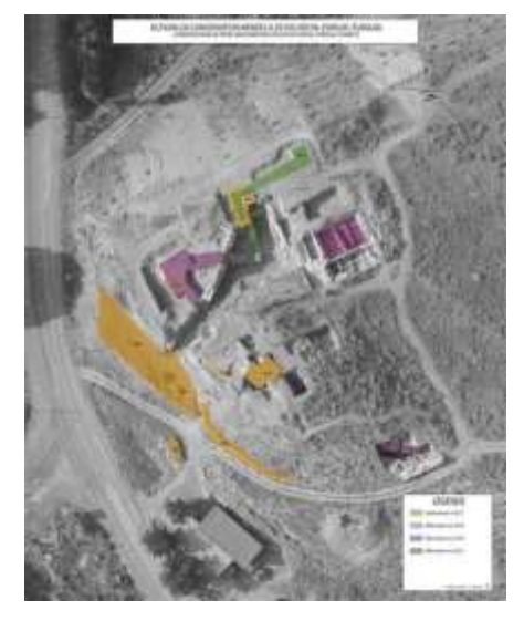
Figure 8: Localisation of conservation action in Chantier 2, Porsuk – Zeyve Höyük

The mission being cancelled in 2020 because of the Covid-19 pandemic, only two campaigns of encapsulation were undertaken, in parallel with the excavations. Other technics of preventive conservation have been implemented such as stone wall consolidation (with earthen mortar), a cover of geotextile membrane and targeted paralloid consolidation for plasters, 'Figure 8'.