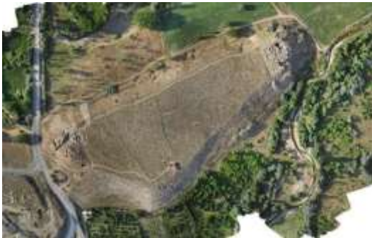
Figure 2. General view of the höyük of Zeyve

The site is a tabular höyük, 400 x 180 m in size, situated at an average elevation of 1300 m, with an area of 4 ha [1] [2], 'Figure 2'.