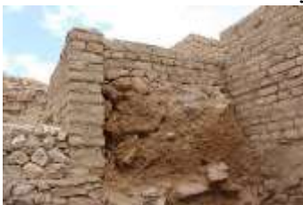
Figure 6: Encapsulation of the original Hittite mud bricks

The first mudbricks were molded in 2018, and implemented the next year. The technical choice to keep the earthen remains safe and understandable for the public has been the encapsulation, ‘Figure 6’. The original volume of wall is covered by a layer of new mudbricks, on the sides and on the top, leaving a void of 5 cm fulfilled by dry soil from the rubble. On the top, mudbricks are laid without mortar and covered by a layer of earthen plaster, ‘Figure 7’.