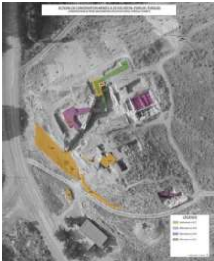
Figure 8: Localisation of conservation action in Chantier 2, Porsuk – Zeyve Höyük

The mission being cancelled in 2020 because of the Covid-19 pandemic, only two campaigns of encapsulation were undertaken, in parallel with the excavations. Other technics of preventive conservation have been implemented such as stone wall consolidation (with earthen mortar), a cover of geotextile membrane and targeted paralloid consolidation for plasters, ‘Figure 8’.