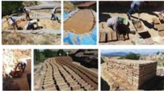
Figure 4. Production line of 2019 the mud bricks of Zeyve Höyük

During the 2014 campaign, testing mud bricks small walls were built, with four different compositions [15]. In 2018, it was possible to identify which combination was the more resistant to wind, rain and snow, and this combination was reproduced in the mud bricks workshop, ‘Figure 4’. The composition of the mud bricks was the following one: earth, 20 % straw and water [10] [11].