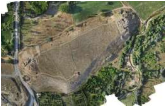
Figure 2. General view of the höyük of Zeyve

The site is a tabular höyük, 400 x 180 m in size, situated at an average elevation of 1300 m, with an area of 4 ha [1] [2], 'Figure 2'.