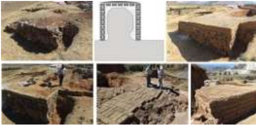
Figure 7: Conservation action of tower North-West, chantier 2, Porsuk – Zeyve Höyük

The mission being cancelled in 2020 because of the Covid-19 pandemic, only two campaigns of encapsulation were undertaken, in parallel with the excavations. Other technics of preventive conservation have been implemented such as stone wall consolidation (with earthen mortar), a cover of geotextile membrane and targeted paralloid consolidation for plasters, ‘Figure 8’.