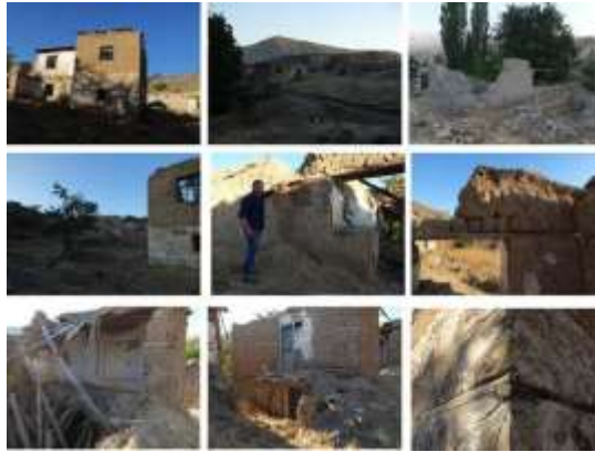
Figure 5. Houses and constructive details of Eski Porsuk village

The earthen material for the preparation of the mixture came from the rubble of the previous excavations. The straw came from old bale and was chopped in small pieces. The mix was then trampled underfoot by workers during one hour, and stayed rotting during twelve hours. The putty was moulded in wooden moulds on the next day. The mud bricks stayed outside to dry one week. Listening to the traditional knowledge, the normal drying time before using is forty days. The module chosen for the new mud bricks was 0,40 m x 0,18 m x 0,12-0,13 m, corresponding to the second state of the Hittite constructions.