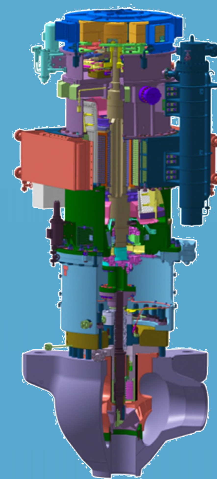
Reactor Coolant pump