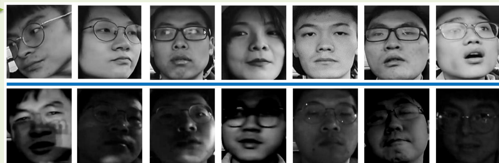
Fig. 1 Driving environment challenges

Improve road safety by mitigating the potential risks caused by human errors.