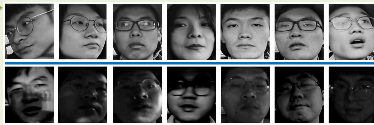
Fig. 1 Driving environment challenges

Improve road safety by mitigating the potential risks caused by human errors.